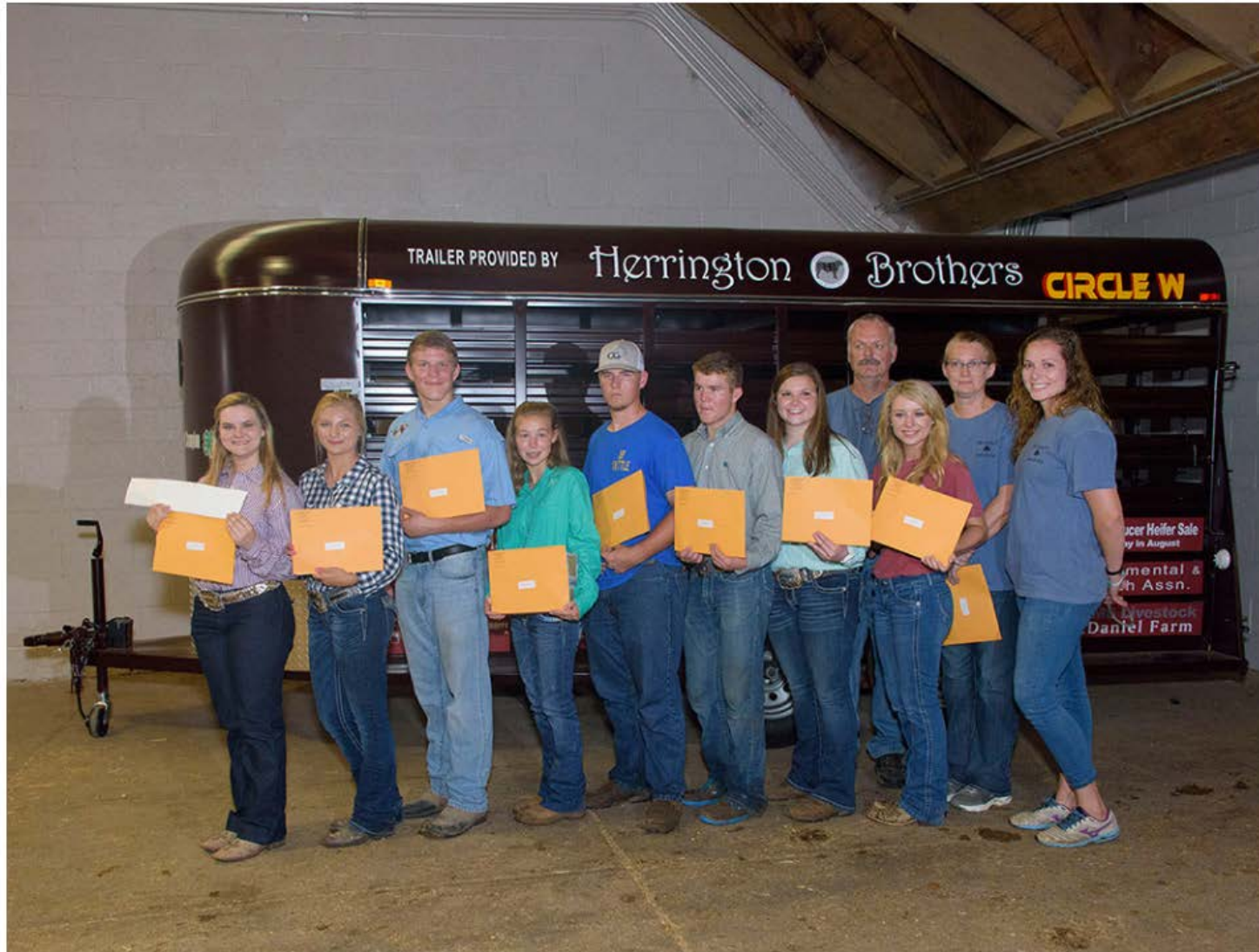
2017 4-H/FFA Replacement Beef Heifer Development Contest Winners