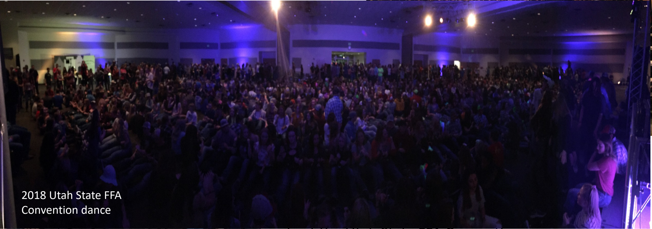
2018 Utah State FFA Convention dance