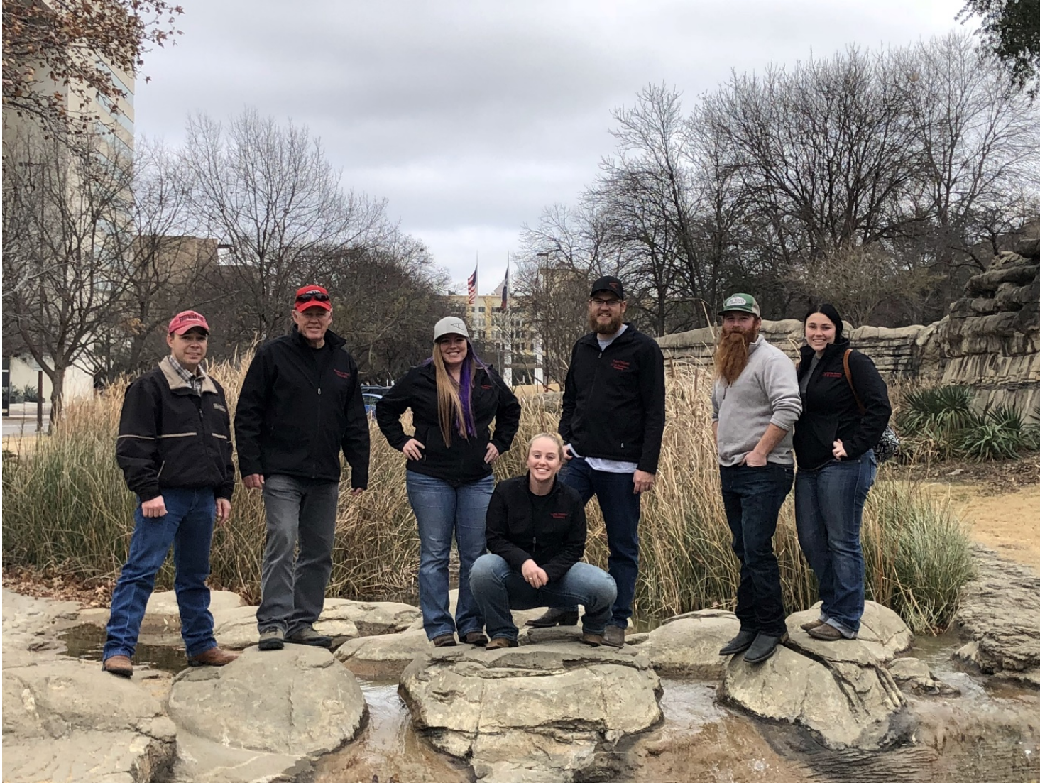
Ag Club Presidency and advisors (in Texas)