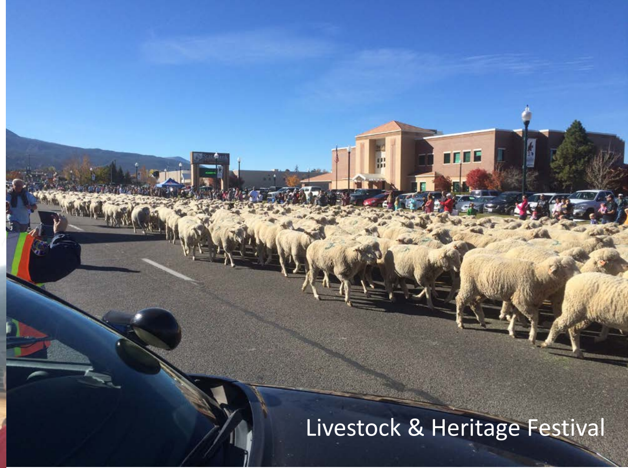
Livestock & Heritage Festival