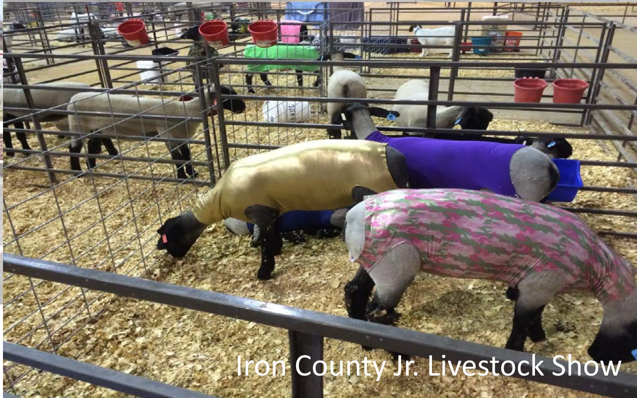
Iron County Jr. Livestock Show