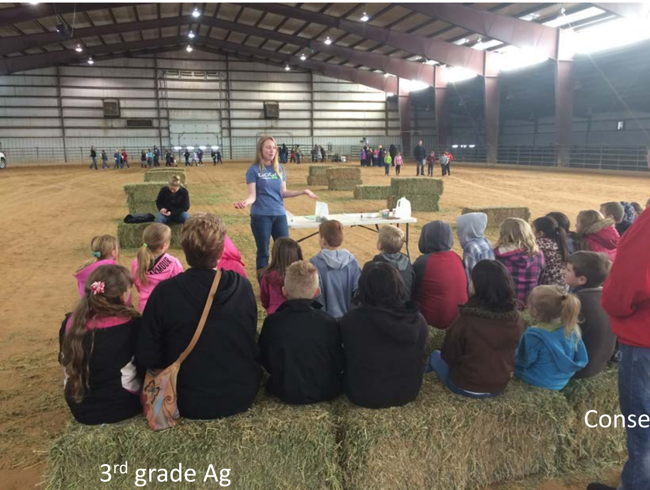
3 rd grade Ag