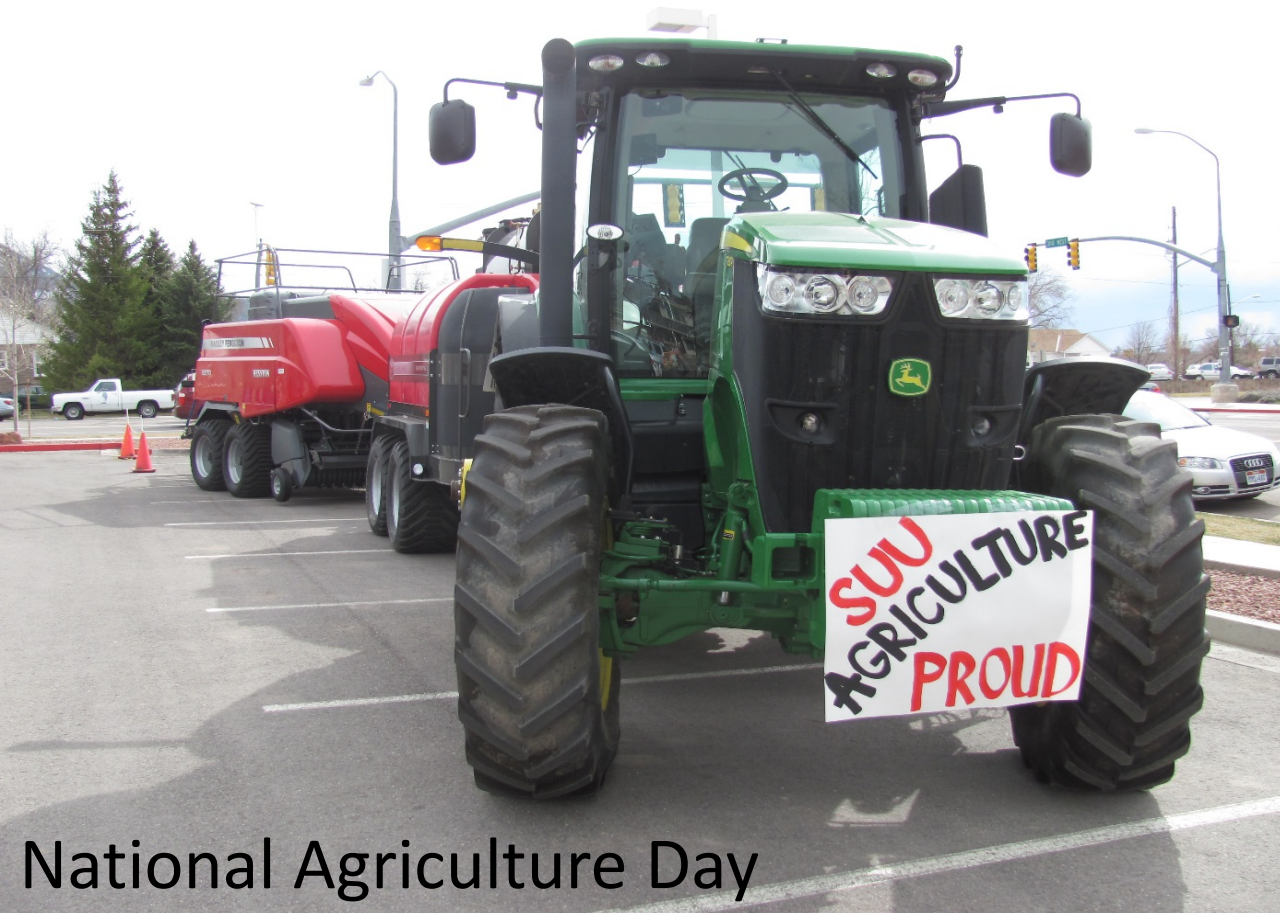
National Agriculture Day