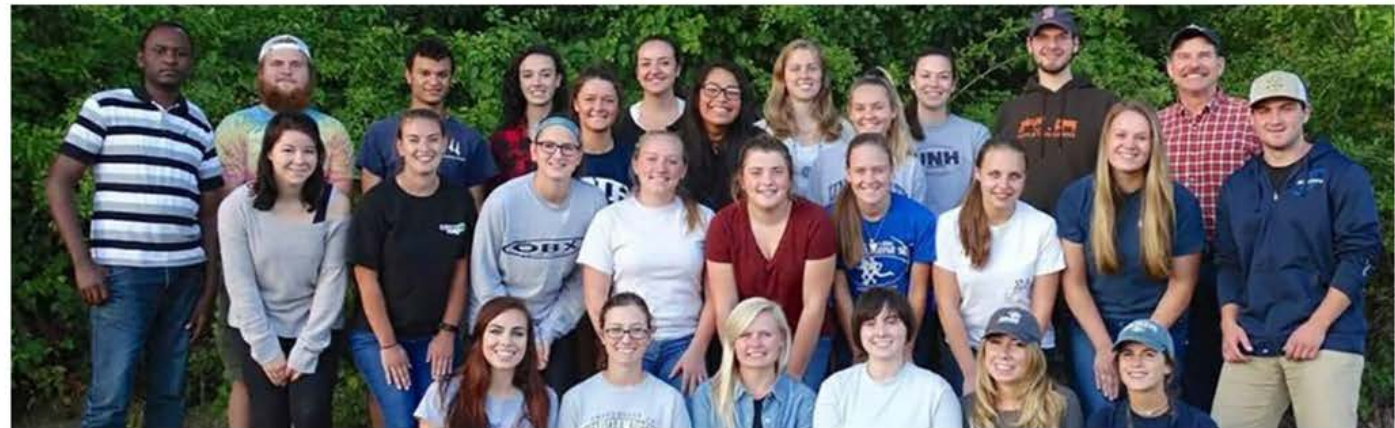
CREAM CLASS OF 2017-2018

Cooperative Real Education in Agricultural Management