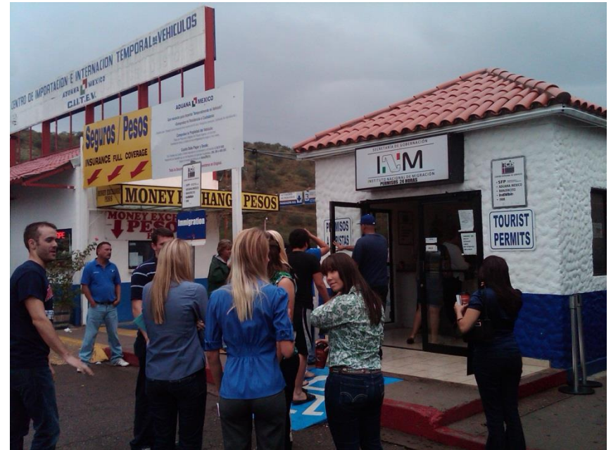
Check point for passports