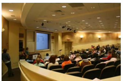
Figure 1. Students participating in the Citizen's Forum

Weeks 13 - 15: Students practice modern citizenship by participating in a model Congress known as the Citizen's Forum (Figure 1 and Table 2).