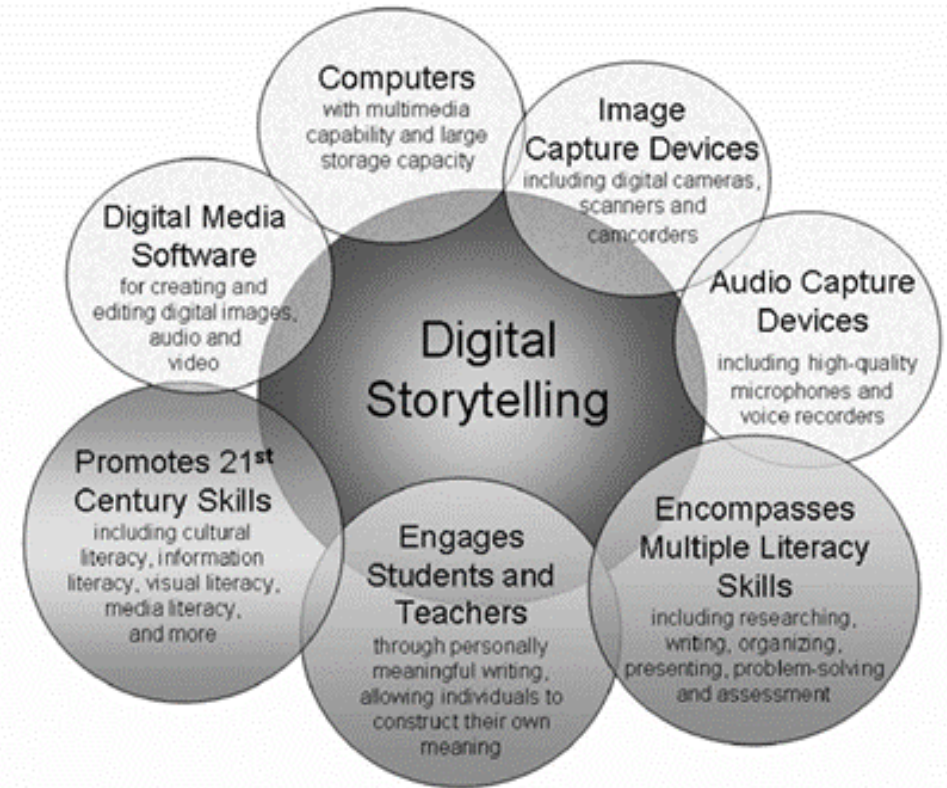
Figure 1. The convergence of digital storytelling in education.