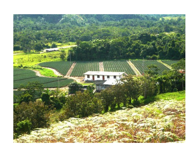
Coast Andes Amazonian